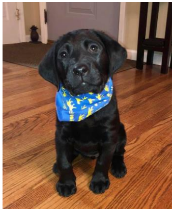
Bobbie and Jim, Vesey's Puppy Raisers

Vesey is a smart and delightful dog with a sweet personality. She learned commands quickly and always wanted to please her people. Vesey developed good impulse control, and was especially focused when "working" on outings. She enjoyed going to restaurants and rarely used the bones or toys we took along, as she is more than happy to sit quietly under a table and watch the action. Vesey was quite entertaining when she wanted to play ball and no one was available. She would toss the ball herself and then chase it. While she would quietly play with toys, lots of toys, it's the ball tossing that was the most whimsical.