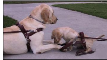
Will you help me grow into this harness!